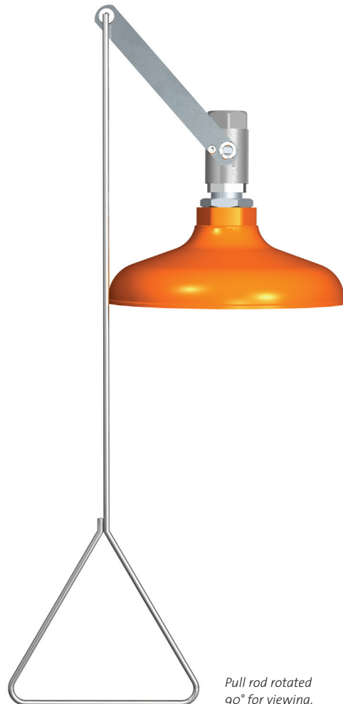
Pull rod rotated 90° for viewing.